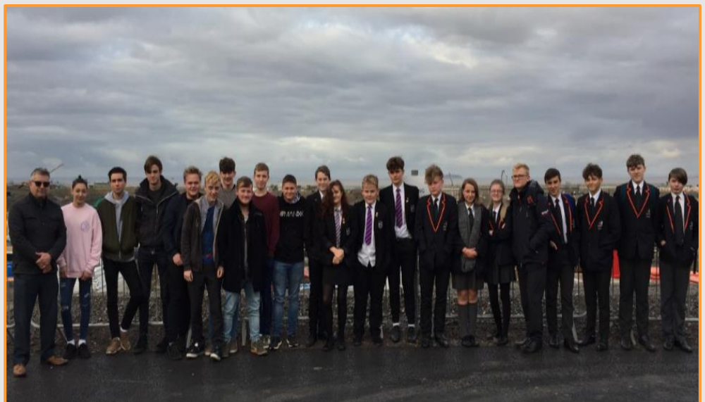
Pictured: students attending the EDF STEM Talent Academy on a site tour of Hinkly Point C.